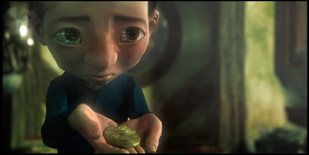
Dreammaker, image courtesy of Leszek Plichta, Filmakademie.

For a complete list of the 3ds Max 2008 software system requirements, visit www.autodesk.com/3dsmax.