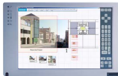
In Autodesk Architectural Studio 3 you can sketch, model, present, and collaborate in a single digital environment.

All conference participants can view and graphically communicate in the same workspace by sketching, modeling, and annotating. With intranet conferencing, design issues get resolved faster, plus you bypass the costs associated with plotting, faxing, and dispatching drawings by courier.