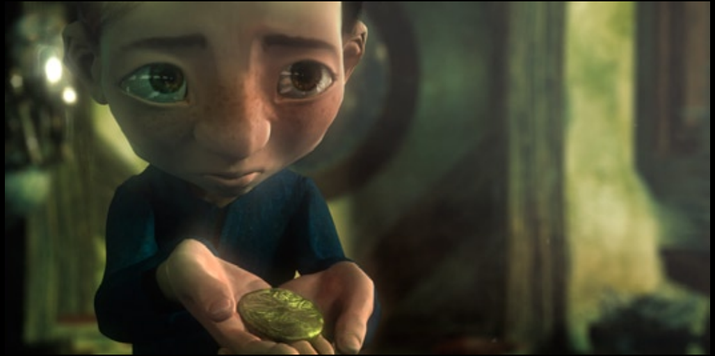
Dreammaker, image courtesy of Leszek Plichta, Filmakademie.

For a complete list of the 3ds Max 2008 software system requirements, visit www.autodesk.com/3dsmax .